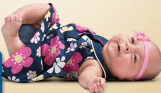
— Alexandria, Dupont Baby

To save you time, we offer convenient online preregistration at TheDupontDifference.com/Preregister . It’s easy. Simply fill out your information and click “send” to e-mail it directly to us. To request a mail-in preregistration form, call (260) 416-3005.